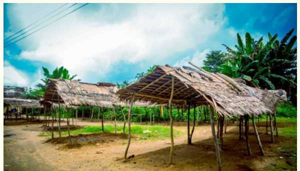
A MARKET IN IKOT EKPE COMMUNITY WHERE FOOD ITEMS ARE SOLD