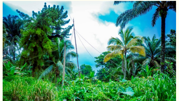
AN IMAGE OF BAMBOO STICK USED IN LIFTING LIVE ELECTRICITY WIRES IN IKOT OBIO AKWA COMMUNITY