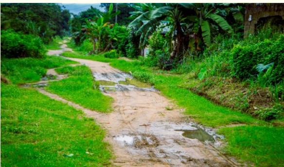
AN INTERNAL ROAD IN IKOT ABASI UFON COMMUNITY