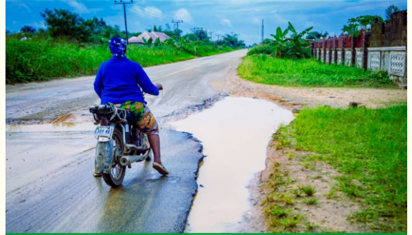
A MOTORIST STRUGGLING TO NAVIGATE PAST A POTHOLE ON THE HIGHWAY