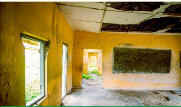
INSIDE VIEW OF THE DILAPIDATED CLASSROOM BLOCK.