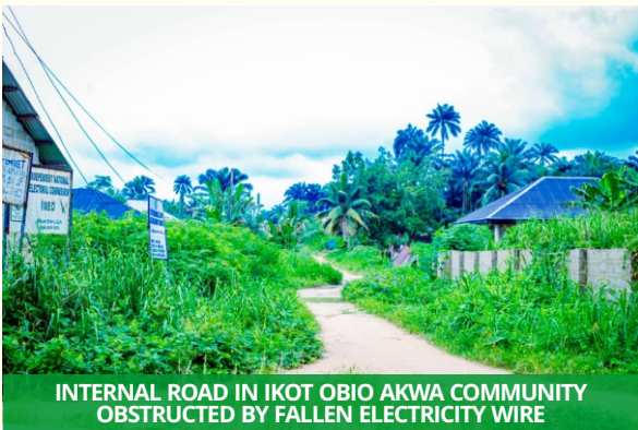
INTERNAL ROAD IN IKOT OBIO AKWA COMMUNITY OBSTRUCTED BY FALLEN ELECTRICITY WIRE