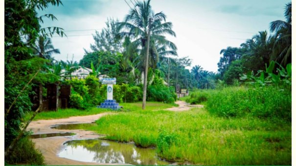
AN INTERNAL ROAD IN IKOT EKPE COMMUNITY