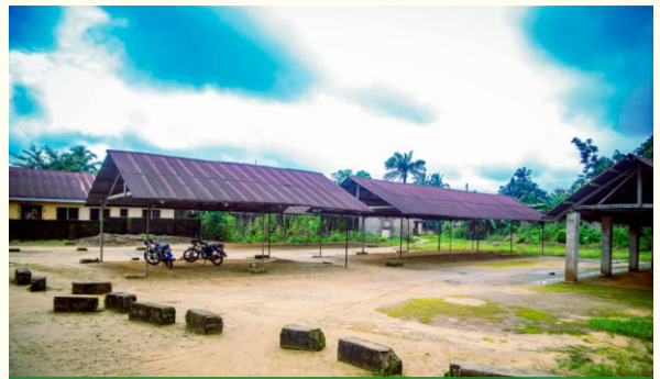
IKOT ABASI UFON MARKET WHERE FOOD ITEMS ARE BOUGHT AND SOLD