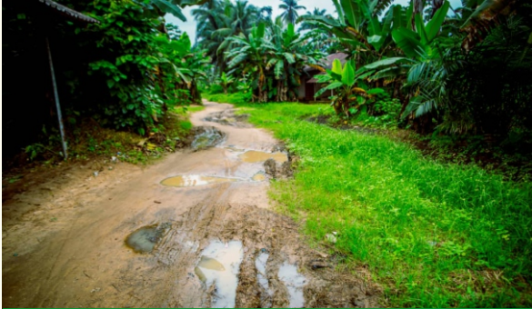
AN INTERNAL ROAD IN IKOT EKPE COMMUNITY