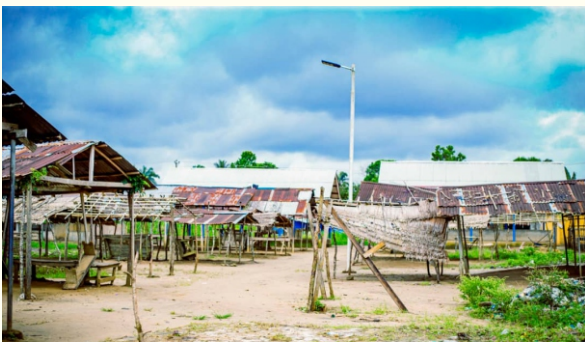
THE MAIN MARKET IN MKPAT ENIN TOWN WHERE FOOD ITEMS ARE SOLD AND BOUGHT.