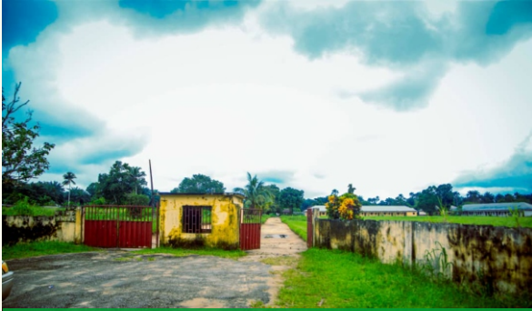
THE GATE OF COMMUNITY SECONDARY SCHOOL, MKPAT ENIN