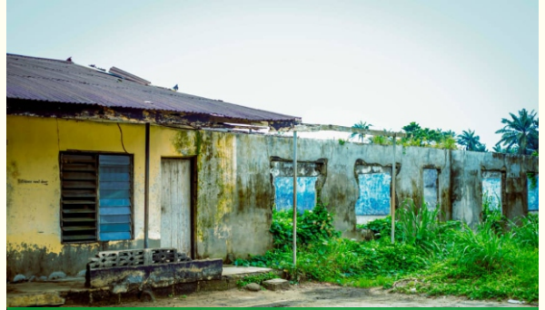
AN ABANDONED BLOCK IN THE SECONDARY SCHOOL.