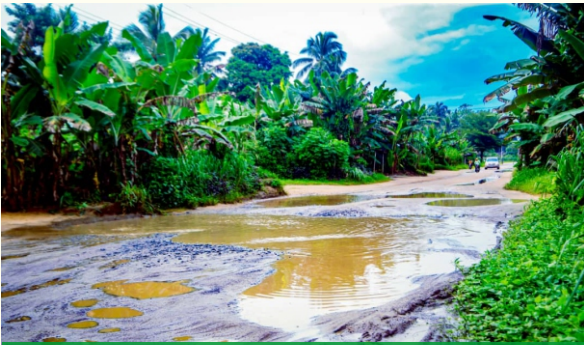
ANOTHER SECTION OF THE HIGHWAY COMPLETELY BROKEN.