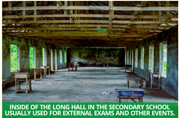
INSIDE OF THE LONG HALL IN THE SECONDARY SCHOOL USUALLY USED FOR EXTERNAL EXAMS AND OTHER EVENTS.