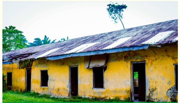
OUTSIDE VIEW OF A DILAPIDATED CLASSROOM BLOCK AT QIC PRIMARY SCHOOL, MKPAT ENIN