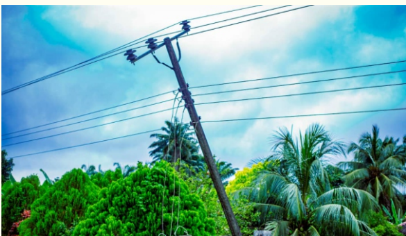
A DILAPIDATED ELECTRICITY POLE LEANING ON A FENCE IN IKOT OBIO AKWA COMMUNITY