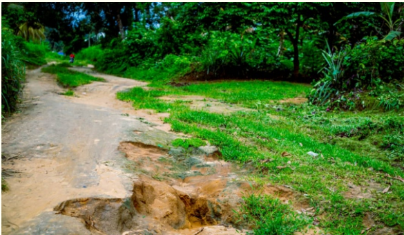
AN INTERNAL ROAD IN IKOT OBIO AKWA COMMUNITY