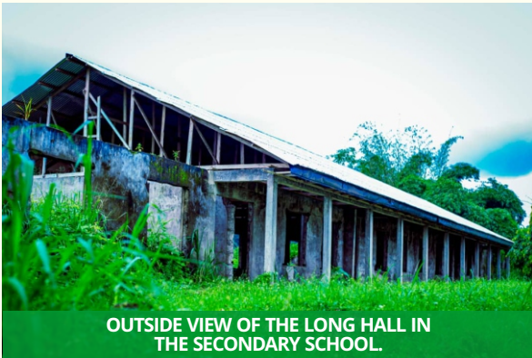
OUTSIDE VIEW OF THE LONG HALL IN THE SECONDARY SCHOOL.