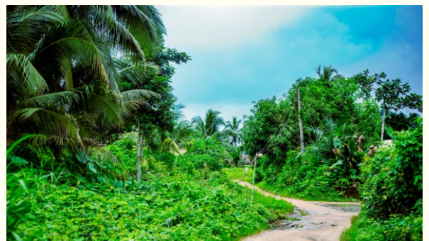
AN INTERNAL ROAD IN IKOT OBIO AKWA COMMUNITY OBSTRUCTED BY FALLEN ELECTRICITY WIRES.