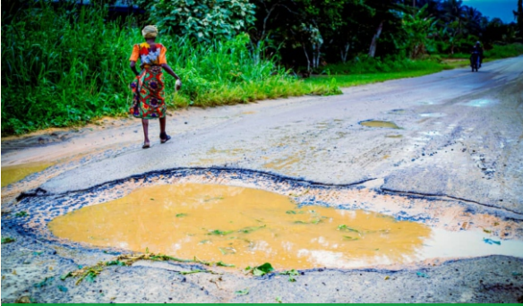
A POTHOLE ON THE HIGHWAY IN MKPAT ENIN URBAN